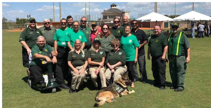
CERT members who responded to the Parkland Active Shooter incident were invited to attend a “Day of Healing”