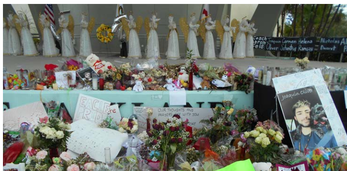
The Memorial at Pine Trails Park – showing an outpouring of community support