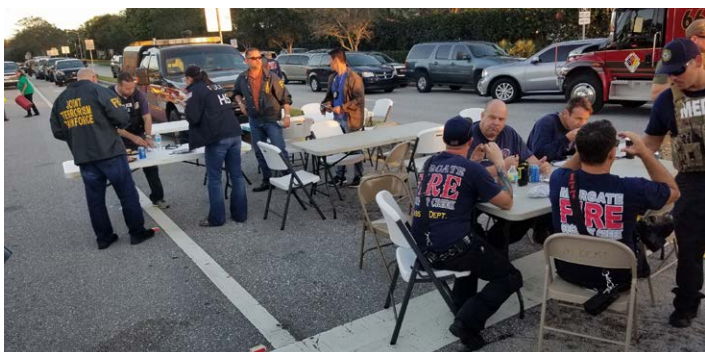
CERT had a full dining setup at the Parkland Active Shooter incident

This was the first time for this type of a response for the CERT teams in Broward County, and, hopefully, will be the last. Thoughts and prayers continue for those not just at Marjory Stoneman Douglas High School, but for all of those persons who have been affected by this senseless act of violence.