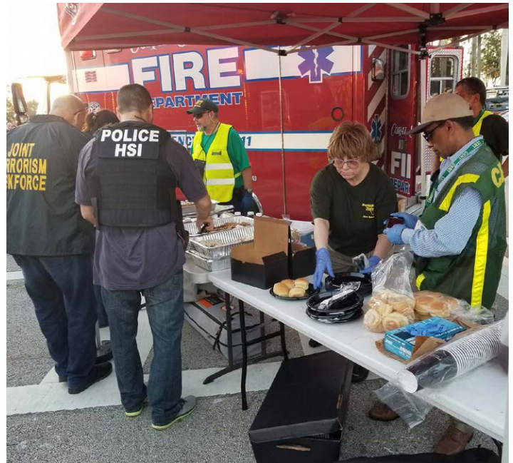
CERT serving meals at the Parkland Active Shooter incident

In the days following the shooting, Coral Springs/Parkland CERT, Margate CERT and the Deerfield Beach CERT Teams were activated two more times for school walkouts. Many schools in Broward and surrounding areas organized walkouts in support of the Marjory Stoneman Douglas student body. Students were exhausted and some dehydrated as they walked from their schools, some well over ten miles,