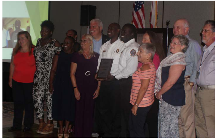
CERT Team of the Year The City of Fort Lauderdale CERT Team